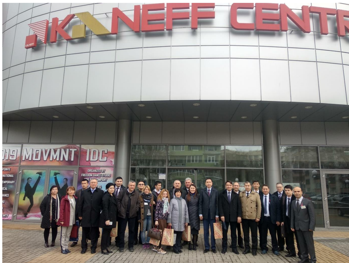
The representatives of the Ministries of Education and Science at a meeting with the Mayor of Ruse.